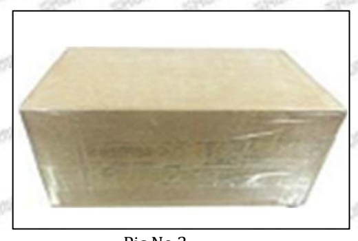
Pic No.2 Domestic express packaging: Wrapped by Transparent tape

Minors are prohibited from using transparent tape, yellow tape, black wrapping protective film, and white wrapping protective film to avoid personal injury.